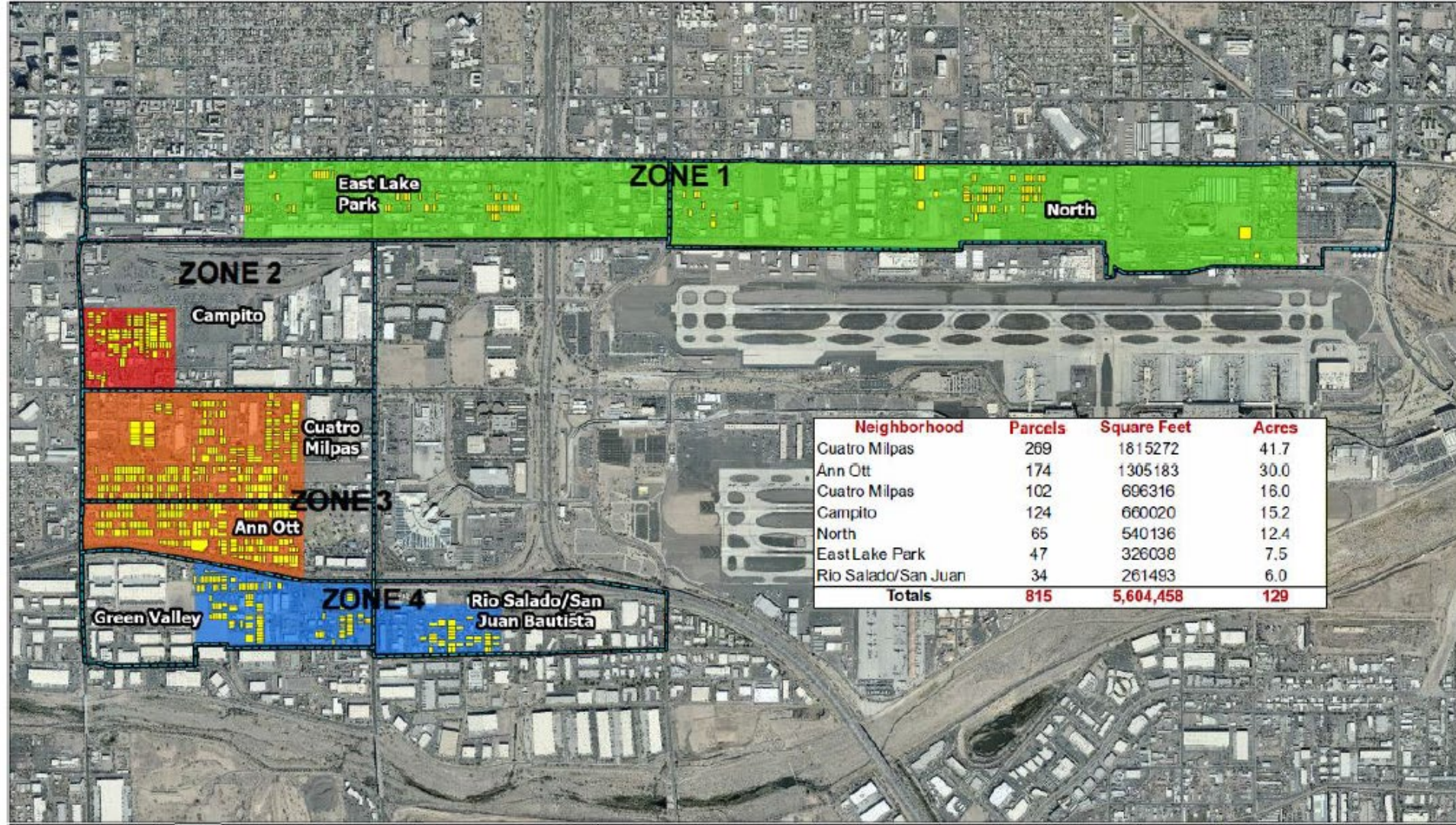
EXHIBIT B - LOT CLEANING ZONES