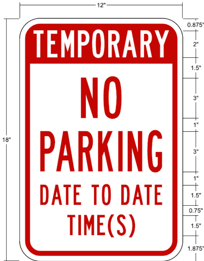
1.500" Radius, 0.375" Border, 0.375" Indent, Red on White; "TEMPORARY" B; "NO" B; "PARKING" B; "DATE TO DATE" B; "TIMES(S)" B;