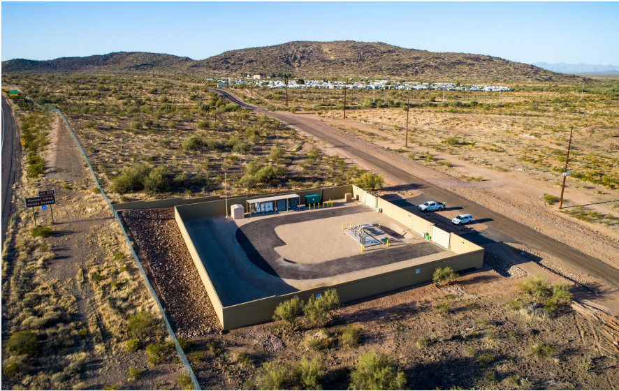
Lift Station 76 aerial facing southwest