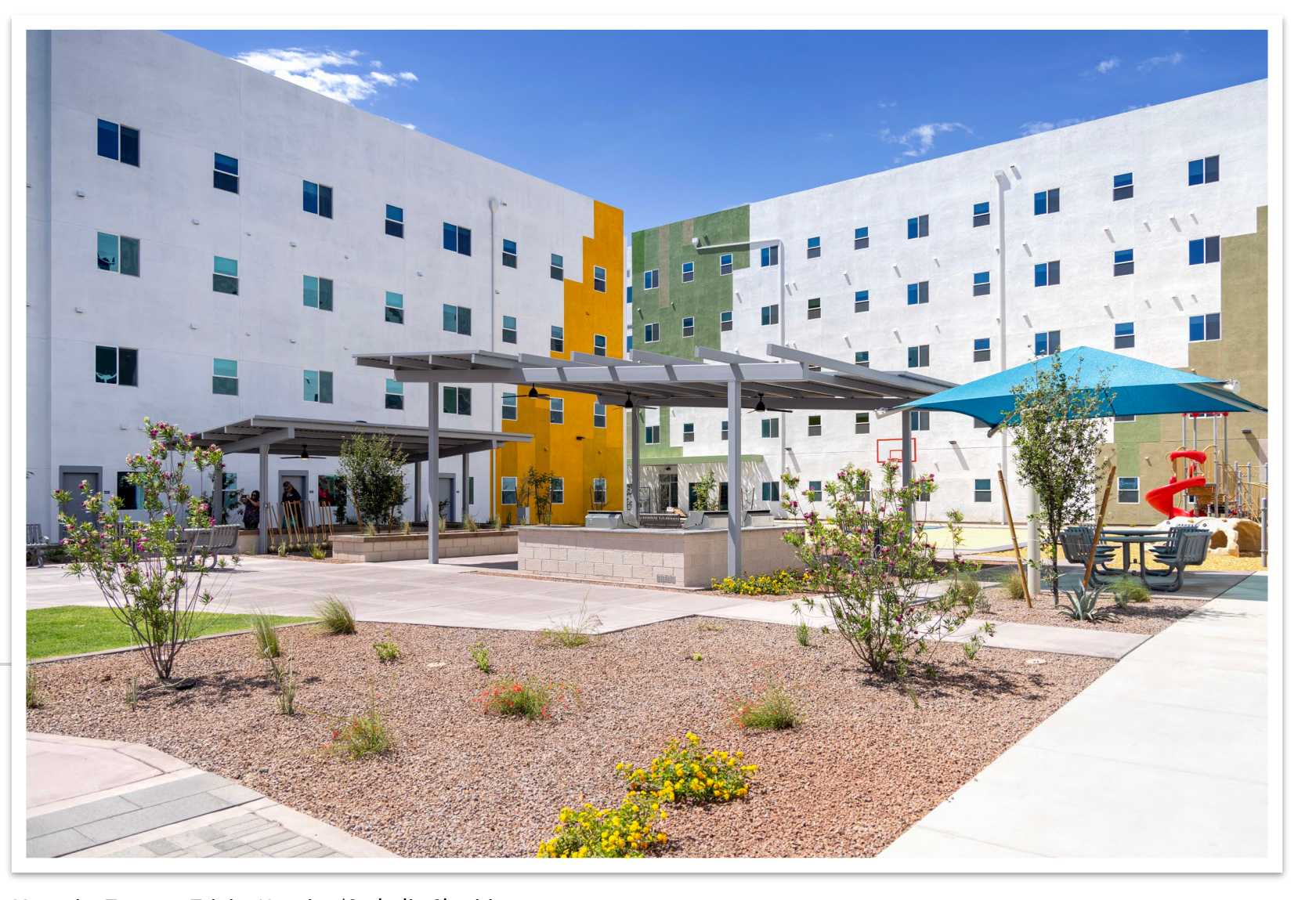
Mesquite Terrace- Trinity Housing/Catholic Charities