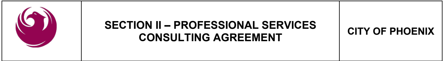
EXHIBIT E - SUPPLEMENTAL TERMS AND CONDITIONS