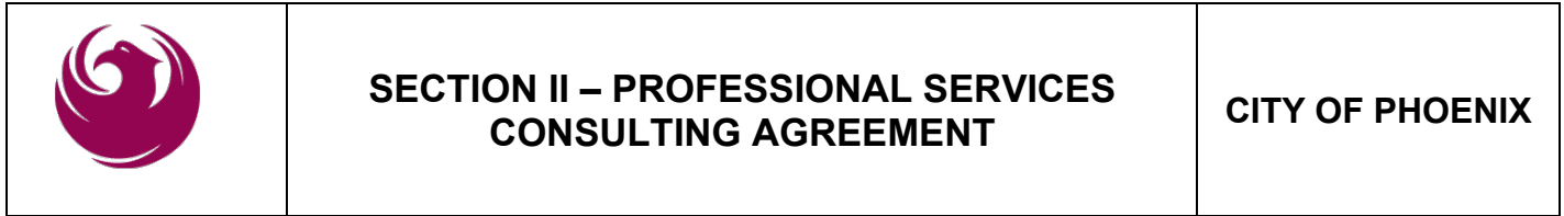
EXHIBIT A – SCOPE OF WORK